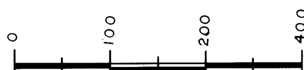
1 Inch = 100 Ft.

Davis Engineering Service, Inc. 576 Spruce Street Del Norte, Colorado 81132